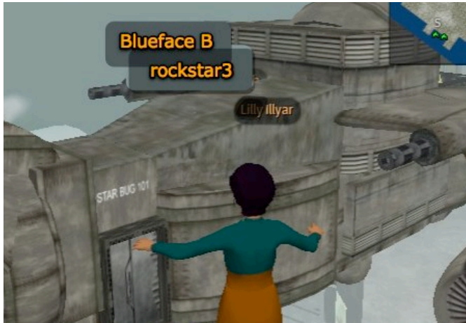
Figure 2: The names of occupants inside the space ship are rendered outside, unbeknownst to the occupants.

difficult and perhaps pointless to check actively whether one is running the risk of having their presence projected beyond the walls that enclose him or her, but it is illustrative of the potential visibility of action brought on by invisible forces, such as a rendering speed and unexpected effects of information design decisions.